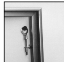
Empty frame for illustration

Step 2: Slip the round lugs over each wall fastener. Hook-Ups! will work with nearly any type of fastener.